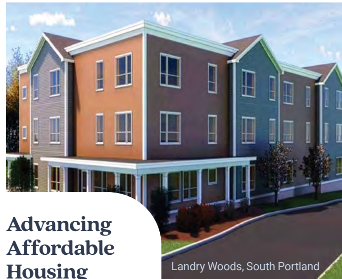
Landry Woods, South Portland